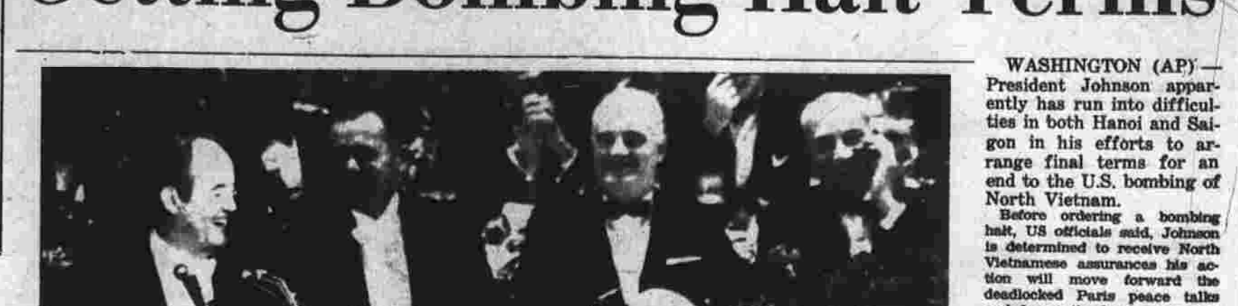
President Johnson and other officials in a meeting.

WASHINGTON (AP) - President Johnson apparently has run into difficulty in both Hanoi and Saigon in his efforts to arrange final terms for an end to the U.S. bombing of North Vietnam.