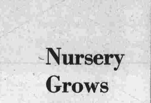
NEW YORK — New parents, still relatively bewitched and bewildered by a baby, appreciate a more sophisticated approach to decorating an infant's room.

What ever the reason, the licky-oo nursery decor, as a leading interior decorator described the bunnies, Hoopoe and accompanying Mother Goose ilk, is losing favor.